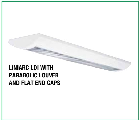
LINIARC LDI WITH PARABOLIC LOUVER AND FLAT END CAPS